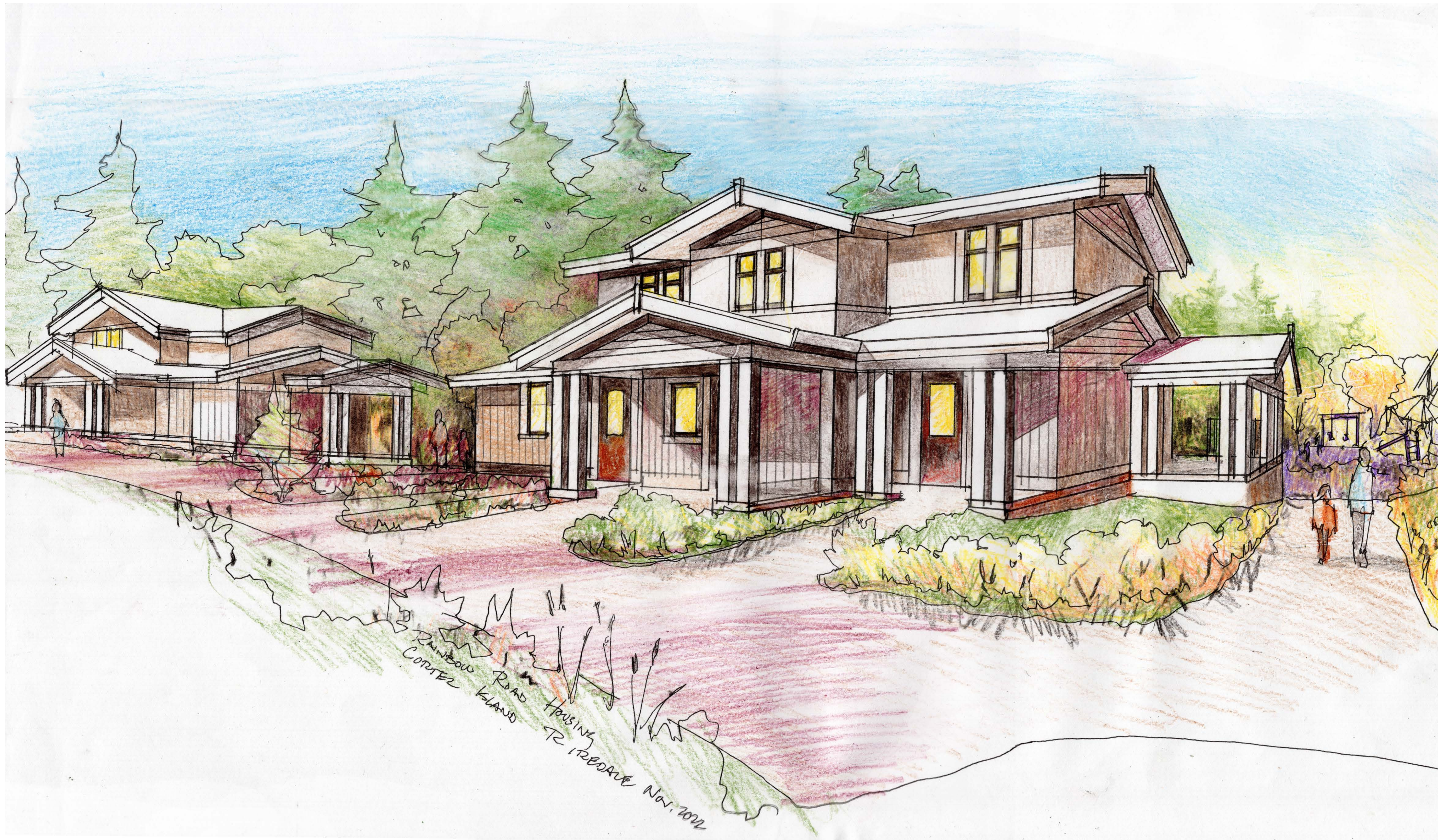
View of Two Storey Triplexes