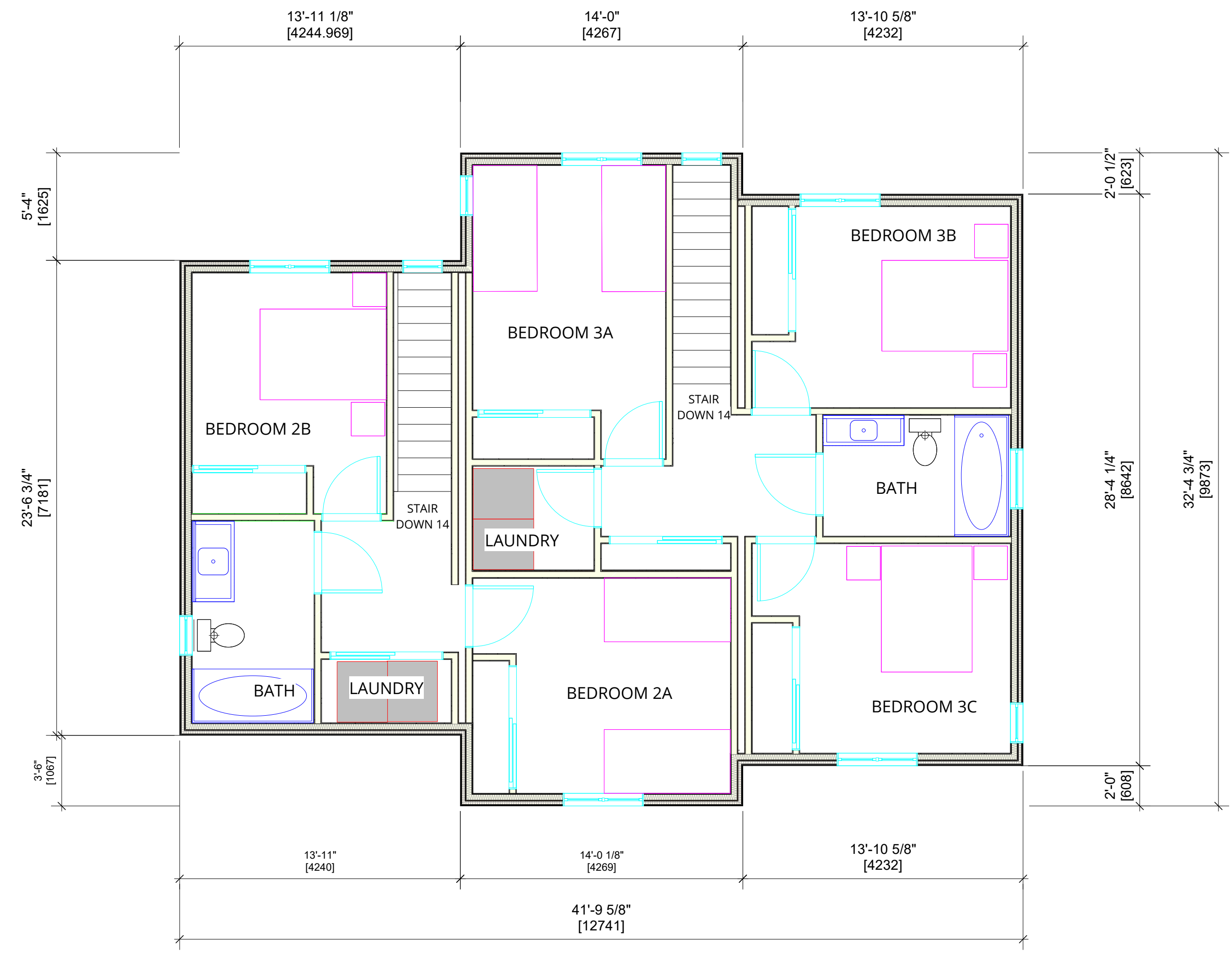
A-401 Triplex B - Main Floor Plan Scale: 1:55

1ST FLOOR: 496 SQ FT 46 SQ M 1ST FLOOR 569 SQ FT 52.9 SQ M UNIT TOTAL: 618 SQ FT 57.4 SQ M UNIT TOTAL: 981 SQ FT 91.1 SQ M UNIT TOTAL: 1244 SQ FT 115.6 SQ M